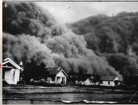
Dust Bowl video 1:30 min

The problem existed for over seven years and by 1940 more than 2.5 million people had been displaced as a result.